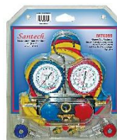
5811258 Gauge Set