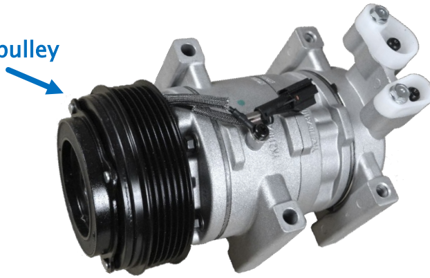
6512978 • Turbo Charged Engine