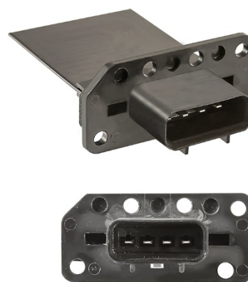
1712209 2008–2012 Ford Escape Blower Motor Resistor; Manual A/C