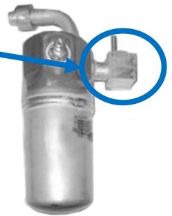
1411734 • 1 st Design With Rear A/C