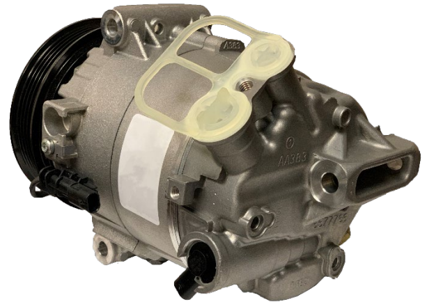
Competitor Design without Mounting Bolt Holes

Manufacturer names, logos and part numbers are for reference only. All prices, taxes and availability are subject to change without notice. This document and any files transmitted with it are confidential and intended solely for the use of the individual or entity to which they are addressed. If you have received this document in error, please delete it immediately. Note that any views or opinions presented in this document are solely those of the author. Any unauthorized review, use, disclosure, or distribution is prohibited. Global Parts Distributors, LLC (gpd) accepts no liability for any damage caused by any virus or other means transmitted by this document. © Global Parts Distributors, LLC (gpd)