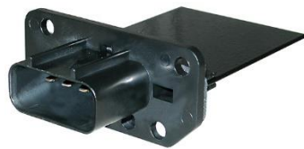
1712040; Manual A/C