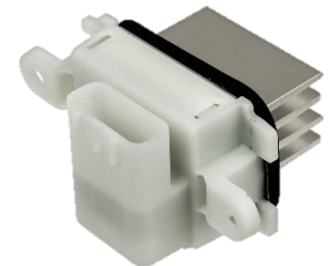
1712678; Automatic A/C; White