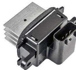
1712398; Automatic A/C; Black