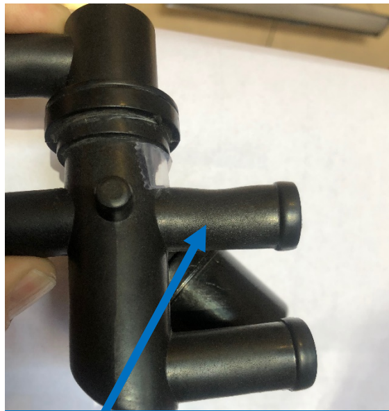
Notice the bend in the heater valve. Here a power tool used too much torque causing the pipe to