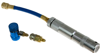
5811675 Hand Turn Oil Injector Kit; R12; R134a; R1234yf; 1/2 oz