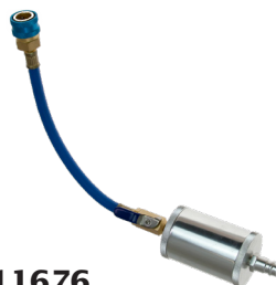
5811676 Oil/ Dye Injector-Quick Disconnect Style Oil Injector; R1234yf; 2 OZ