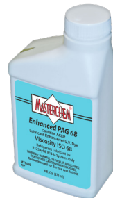
8011299 PAG 68 Enhanced with ACEP Additive; 8 oz