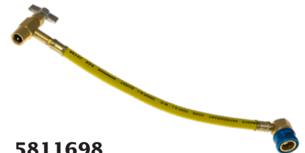
5811698 Charging Hose w/o Gauge for R1234yf CARB Cans with Self-Sealing Can Tap