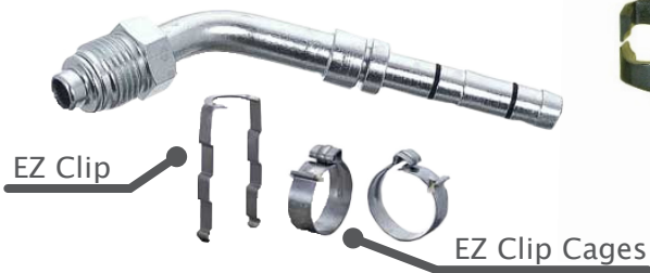
45° MALE O-RING EZ CLIP FITTING WITH CAGES AND CLIP