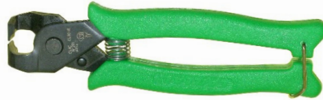
1023956 EZ CLIP CRIMPER TOOL

Visit gpdtechtips.com • #135 for instruction on how to use EZ Clips, Cages, and Crimper.